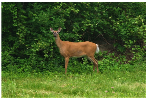
Deer at Kroll Pasture

During these times, our properties have become more important than ever as a place to enjoy some fresh air, exercise, listen to the birds, and relax. Be sure to follow social distancing guidelines.