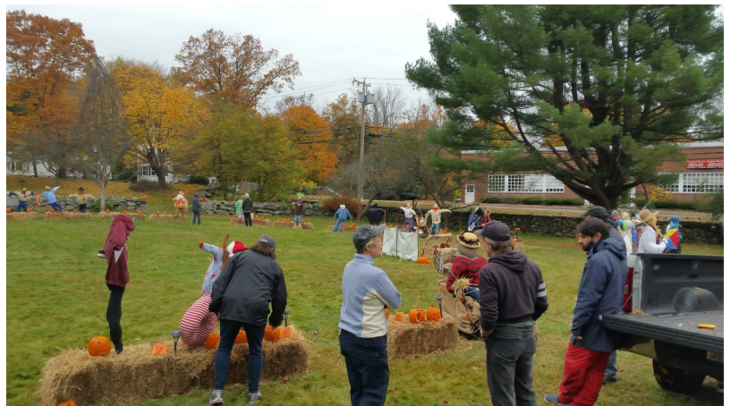
Scarecrow Festival at Bartlett Park